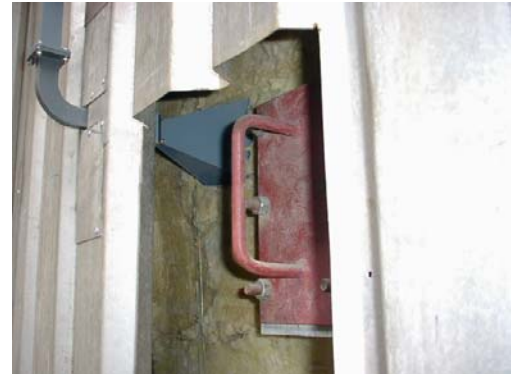
Local sensor or FFM-A carbon in ash analyzer.