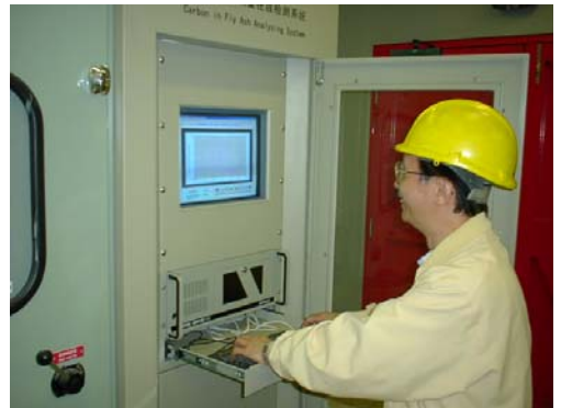
The FFM-A analyzer being calibrated by specialist according to the actual carbon content counter checked with laboratory.