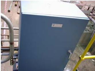
Local control panel of FFM-A carbon in ash analyzer.

Castle Peak B Power station houses four 680 MW coal fired power units.